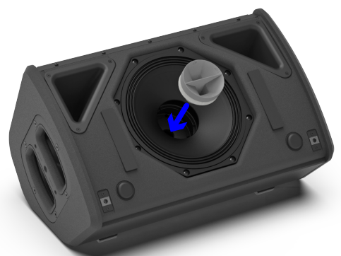
Grille removed, an optional magnetic horn can be quickly fitted to change directivity from 100°x100° to 110°x60°

P8 acoustic phase response is NEXO phase signature allowing inter-operability between all NEXO speakers at all crossover points, except for the monitor setups where latency is minimized.