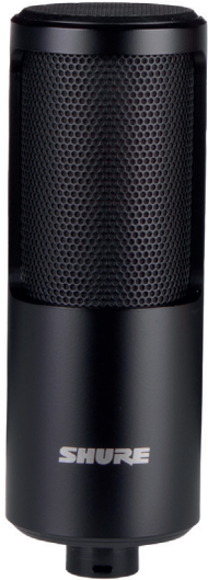
SM4-K Home Recording Microphone