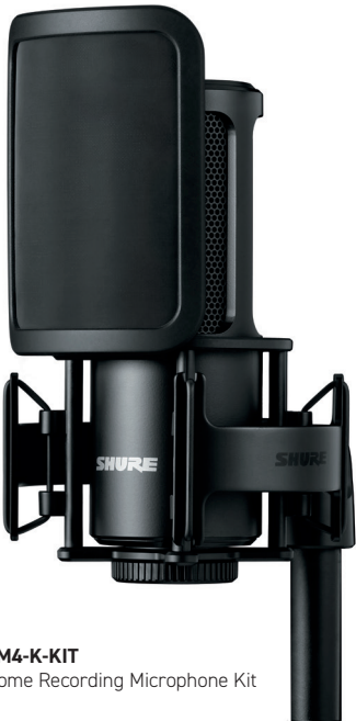
SM4-K-KIT Home Recording Microphone Kit